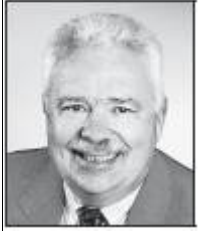
GUS AYER MAYOR'S VIEW

Gus Ayer is the mayor of Fountain Valley.